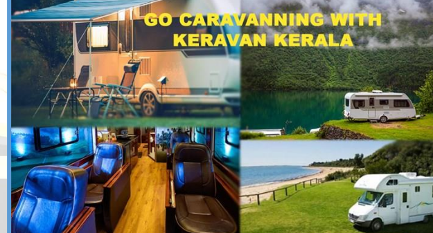
Fig.1 keravan kerala

✓ It involves various stakeholders, including local self-government institutions, in creating eco-friendly Caravan Parks throughout the state for visitors to explore their preferred destinations.